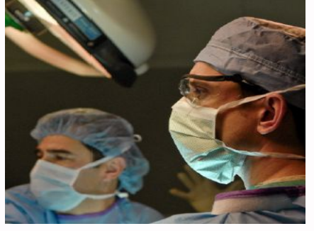
Healthcare investment participation